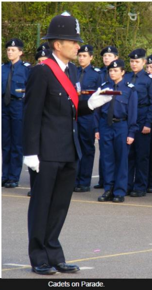
Cadets on Parade.

Aspire to be different. Join the Volunteer Police Cadets at Bromley. Meet with like minded young people with shared interests. Have fun, learn, develop and help in your local community. Check out "met volunteer police Cadets, part 1" on YOUTUBE for a 2 min video.