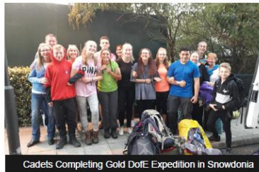
Cadets Completing Gold DotE Expedition in Snowdonia